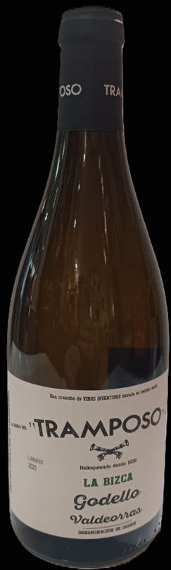
Tramoso - 28,00 € Godello - Valdeorras (Ourense)