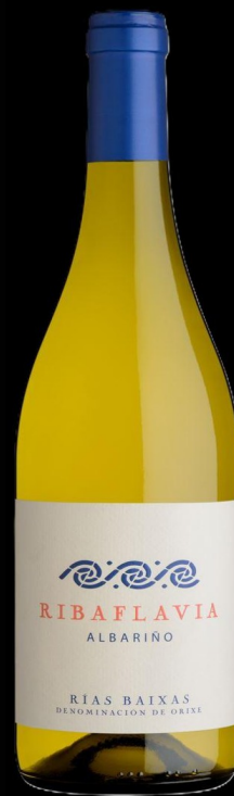
RIBAFLAVIA 17,00 €