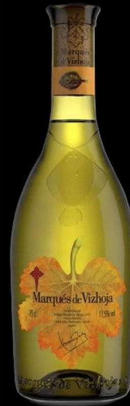
Marquez de Vizhojas, 15,00 €