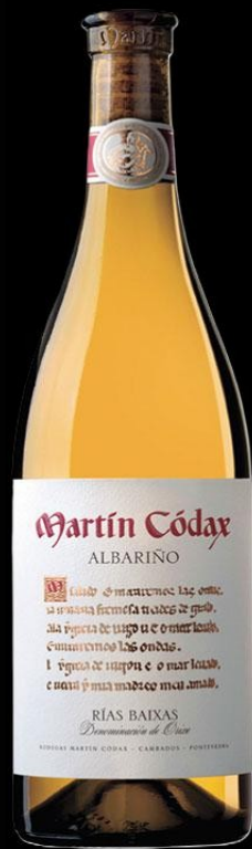
MARTIN CODAX 25,00 €