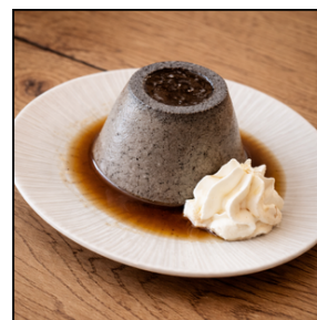
Black sesame Panna Cotta