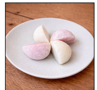
Mochi Ice Cream