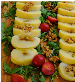
Up to 50 persons