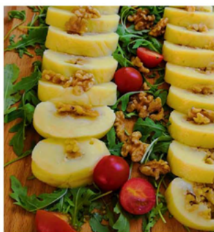
Up to 50 persons