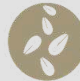
Granos de sésamo