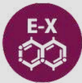
Dióxido de azufre y sulfitos