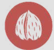
Frutos de cáscara