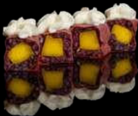
143 SOY MANGO | SOY MANGO riso venere, mango avvolto in sfoglia di soia con sopra philadelphia venere rice, mango wrapped in soy paper with philadelphia on top €5,00 Allergeni | Allergens: 1.6.7