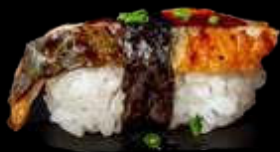
76 NIGIRI UNAGI 2PZ | EEL NIGIRI 2PCS

anguilla, sesamo e salsa teriyaki eel, sesame and teriyaki sauce