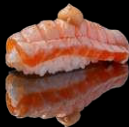
78 NIGIRI SAKE SCOTTATO 2PZ | SEARED SALMON NIGIRI 2PCS

salmone scottato, farina di tempura, salsa spicy seared salmon, tempura flour, spicy sauce