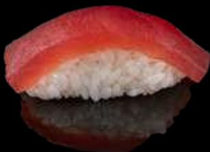
74 NIGIRI MAGURO 2PZ | NIGIRI MAGURO 2PCS