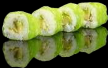
144 AVOCADO | AVOCADO riso, foglia di soia e avocado rice, soy paper and avocado €6,00 Allergeni | Allergens: 1.6.7