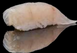
75 NIGIRI SUZUKI 2PZ | SEA BASS NIGIRI 2PCS