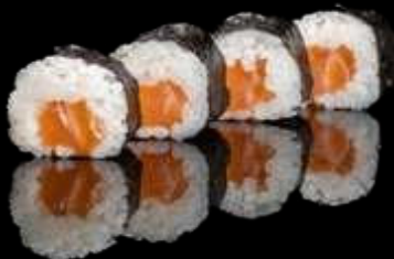
140 SAKE | SALMON alghe, riso e salmone seaweed, rice and salmon €4,50 Allergeni | Allergens: 4