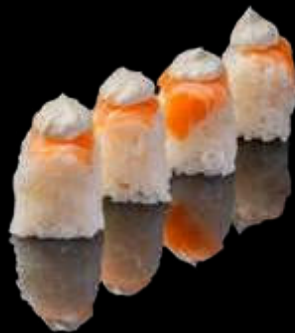
145 HOSO FRESH | FRESH HOSO riso, carpaccio di salmone, avvolto con philadelphia e farina per tempura rice, salmon carpaccio, wrapped with philadelphia and tempura flour €6,00 Allergeni | Allergens: 1.4.7