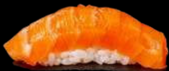
73 NIGIRI SAKE 2PZ | SALMON NIGIRI 2PCS