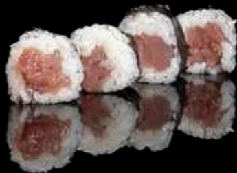
141 MAGURO | TUNA alghe, riso, tonno seaweed, rice, tuna €5,00 Allergeni | Allergens: 4