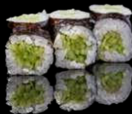
142 KAPPA | CUCUMBER riso, alga e cetrioli rice, seaweed and cucumber €4,00