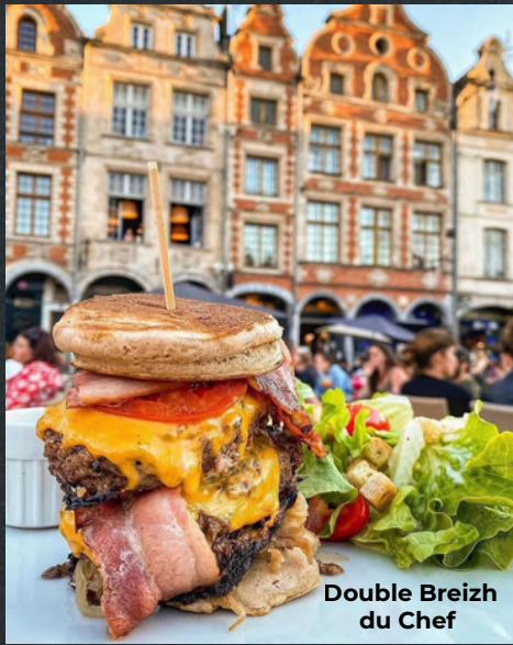
Double Breizh du Chef