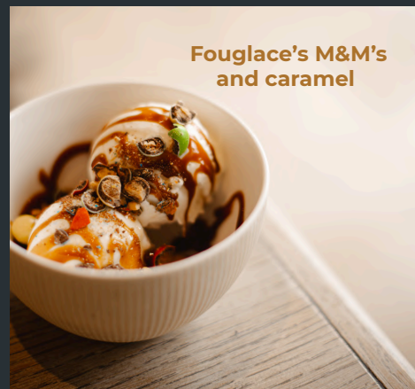
Fouglace's M&M's and caramel

La Muesli ( chocolate or red fruit coulis ) ( 2 scoops of yogurt, chocolate sauce or red fruits coulis, muesli )