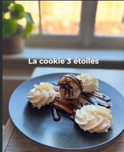
La cookie 3 étoiles

( Pan-fried pineapple, coconut ice cream scoop, homemade salted caramel, whipped cream )