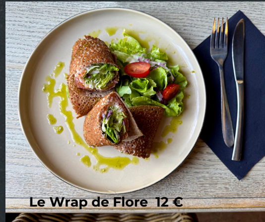
Le Wrap de Flore 12 €

( Homemade blinis, chopped steak, tomato, smoked bacon, onions, maroilles sauce, potatoes and salad )