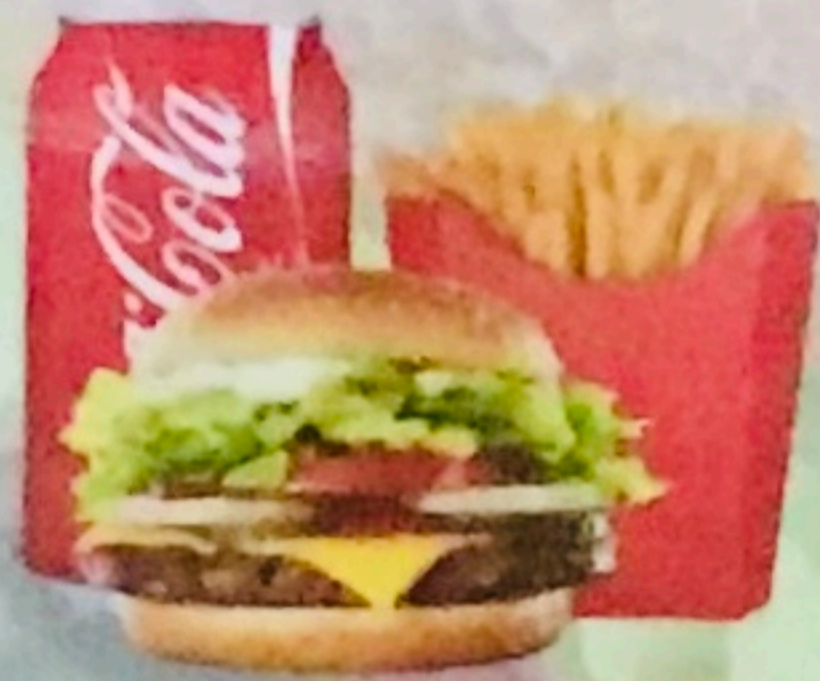
Hamburguer + batatas + sumo 6.00€