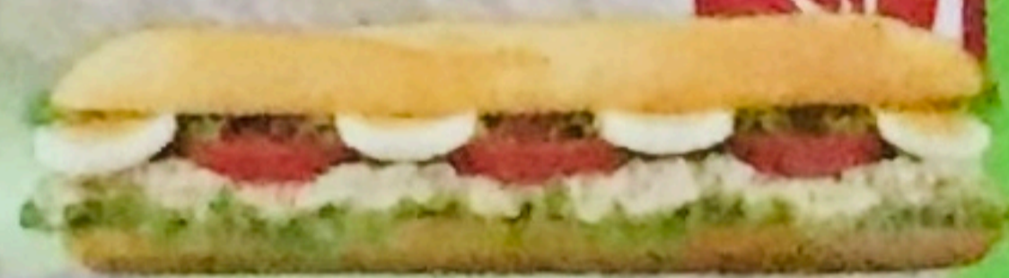
Baguete + sumo 5,50€ atum, delicias, frango, bacon