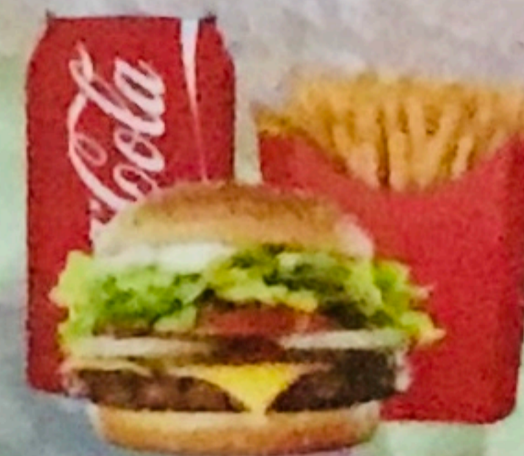
Hamburger + chips + juice 6.00€