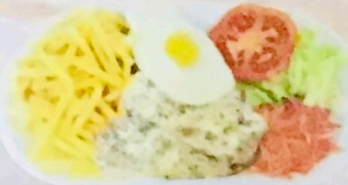
Bitoque peru 7,50€