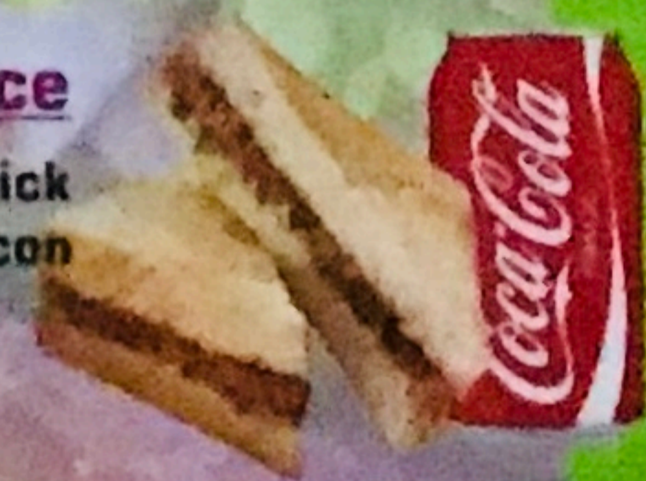
Toast + juice 5,00€ tuna, mixed, crab stick chicken, bacon