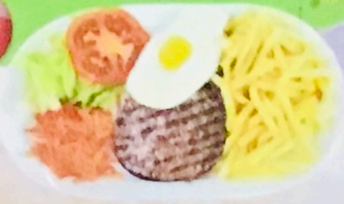
Bitoque hamburger 7,50€