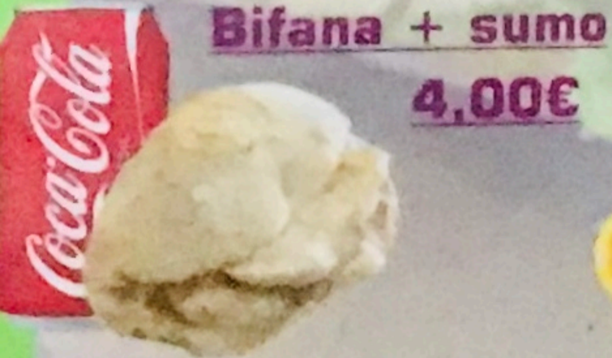
Bifana + sumo 4,00€