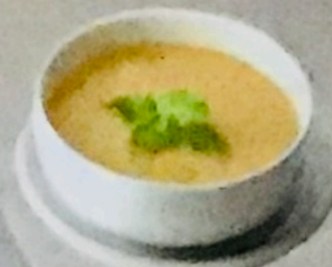
Soup of the day 1.50€