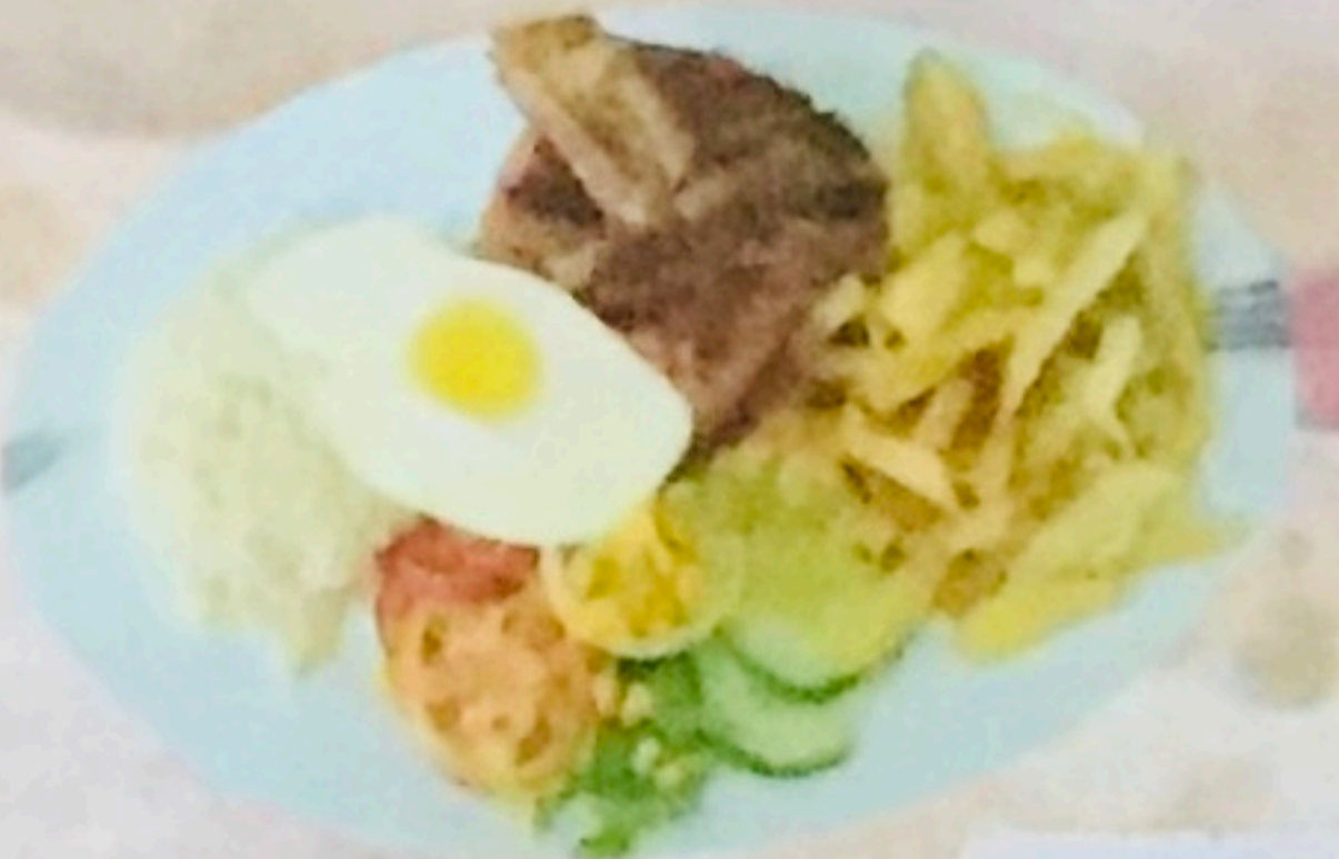
Bitoque frango 7,50€