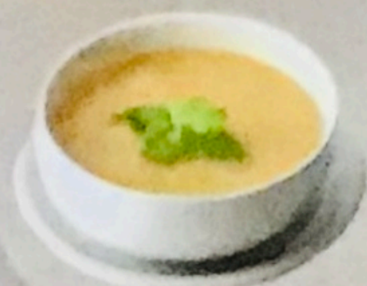
Sopa do dia 1.50€