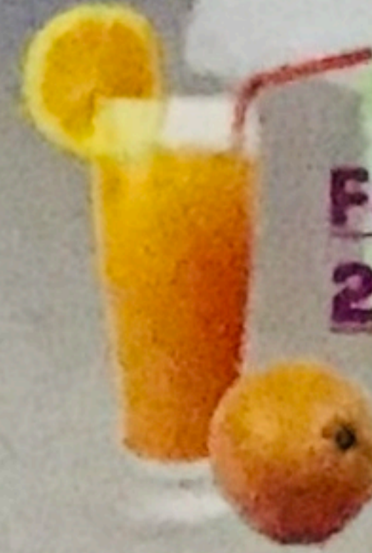
Fresh orange juice 2,20€