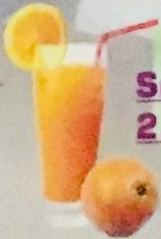
Sumo de laranja 2,20€