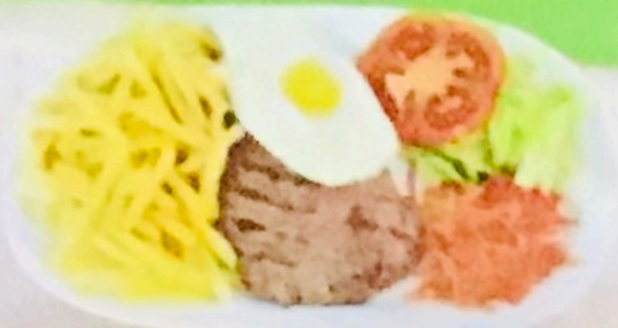
Bitoque porco 7,50€