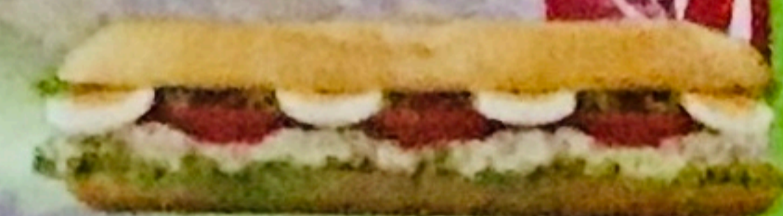
Baguete + juice 5,50€ tuna, crab stick, chicken, bacon