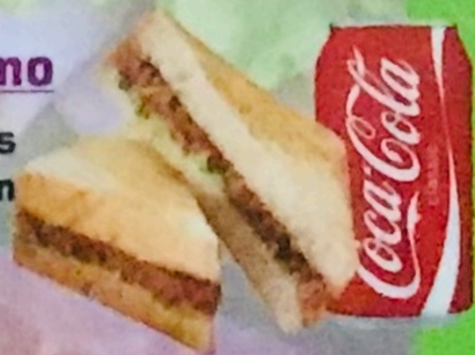
Tosta + sumo 5,00€ atum, mista, delicias frango, bacon