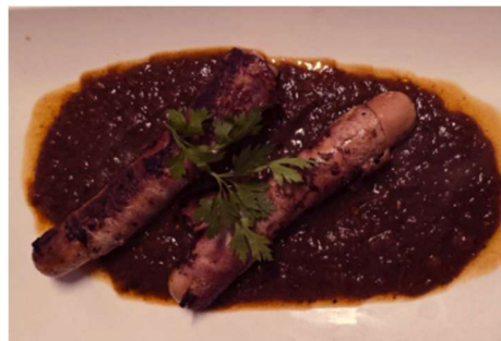
Berner Sausages with Gulasch Juice