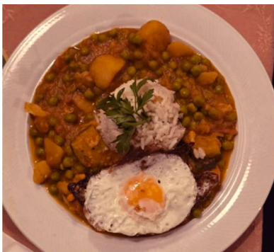
Vegetable Stew with Rice, Potatoes, Fried Egg