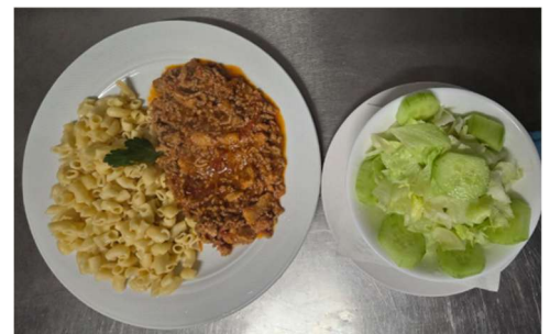
Pakistana Meat Sauce