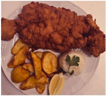
Cordon bleu from Pork