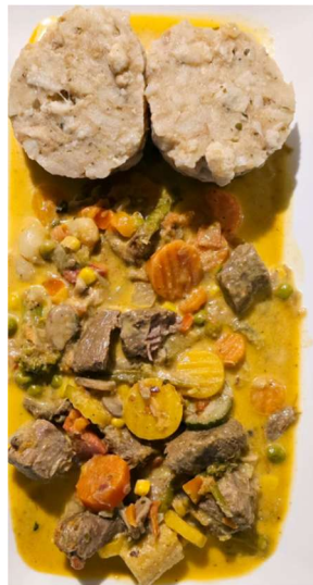
Beef boiled with Vegetables