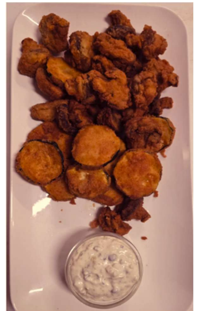
Breaded Zucchini / Mushrooms mixed with Sauce Tatar