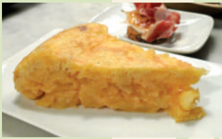
TORTILLA DE PATATA OMELETTE OF POTATOES