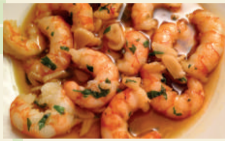
GAMBAS AL AJILLO GARLIC PRAWNS