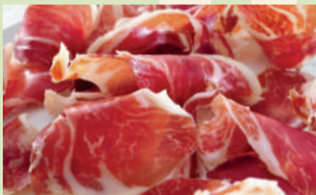
JAMÓN SERRANO SERRANO HAM