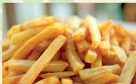
PATATAS FRITAS POTATOES