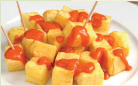
PATATAS BRAVAS SPICY POTATOES